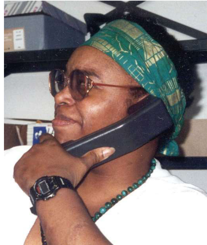
Muslim Revolutionary Black Panther Party & Black Liberation Army Veteran Former u.s.-Held Prisoner of War 1950-2003 (RIP)