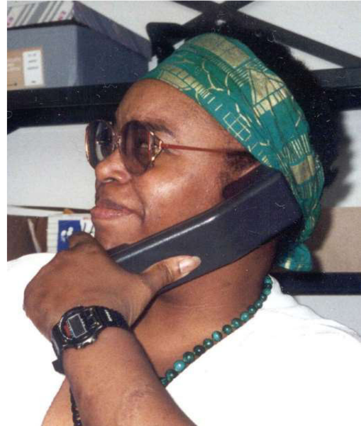
Muslim Revolutionary Black Panther Party & Black Liberation Army Veteran Former u.s.-Held Prisoner of War 1950-2003 (RIP)