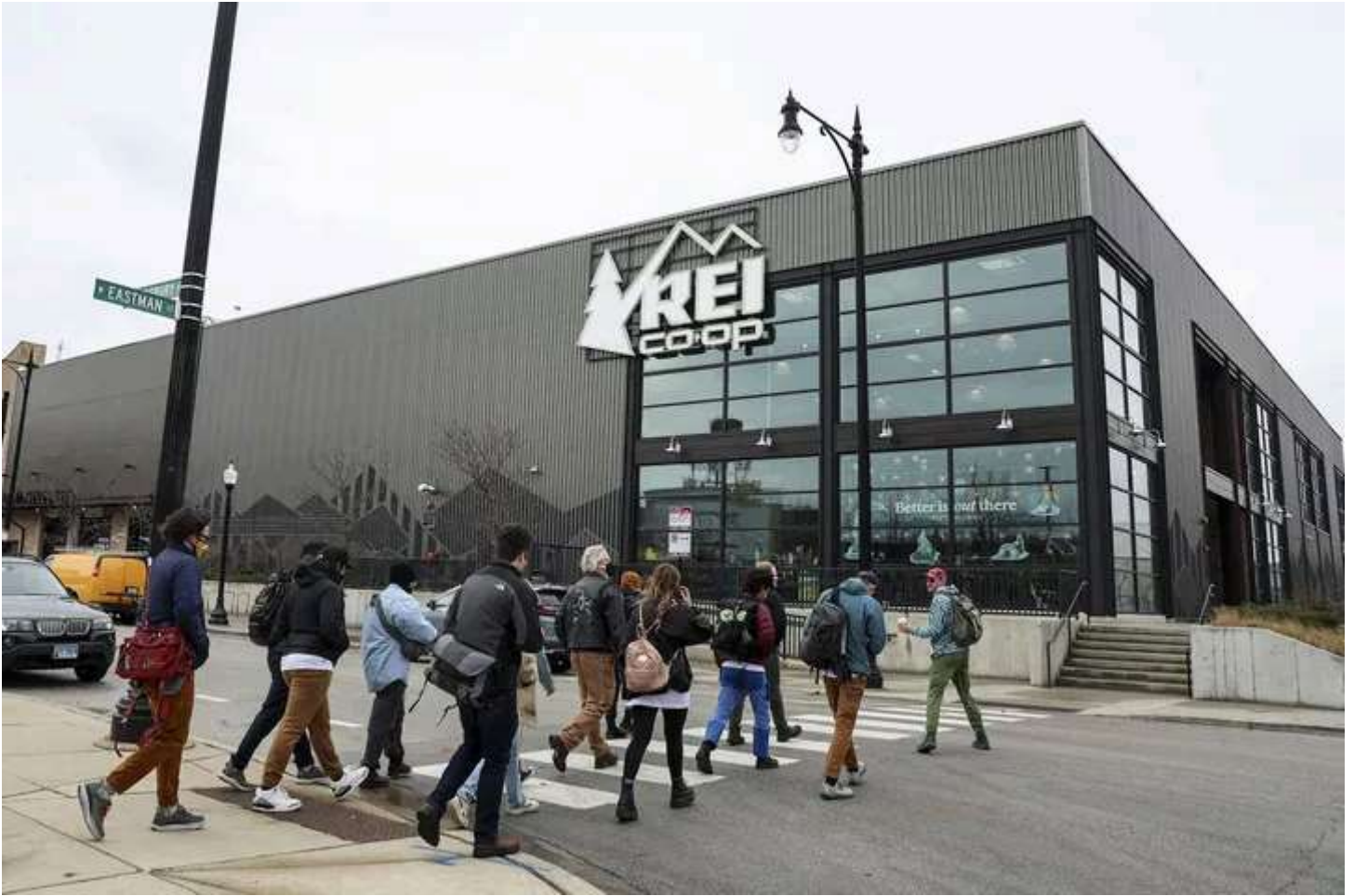
REI workers in Chicago marched to their store to announce their intention to unionize last year.

REI eventually extended the raises but later took them back. The unions say it did so after workers refused to waive their right to strike as a precondition; REI says it was a temporary agreement that the union refused to extend.