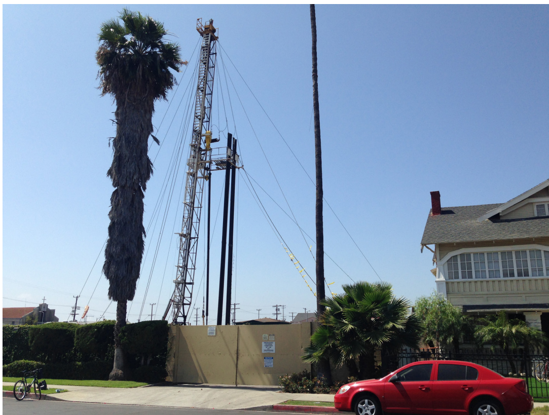
Jefferson drill site, Los Angeles, by Redeemer Community Partnership

We identified unacceptable public health and safety risks from the use of dozens of air toxics in Los Angeles County communities, including their usage next to homes, schools, and hospitals; the known health risks of these chemicals; and inadequate reporting and secrecy that hide the full risks from the public.