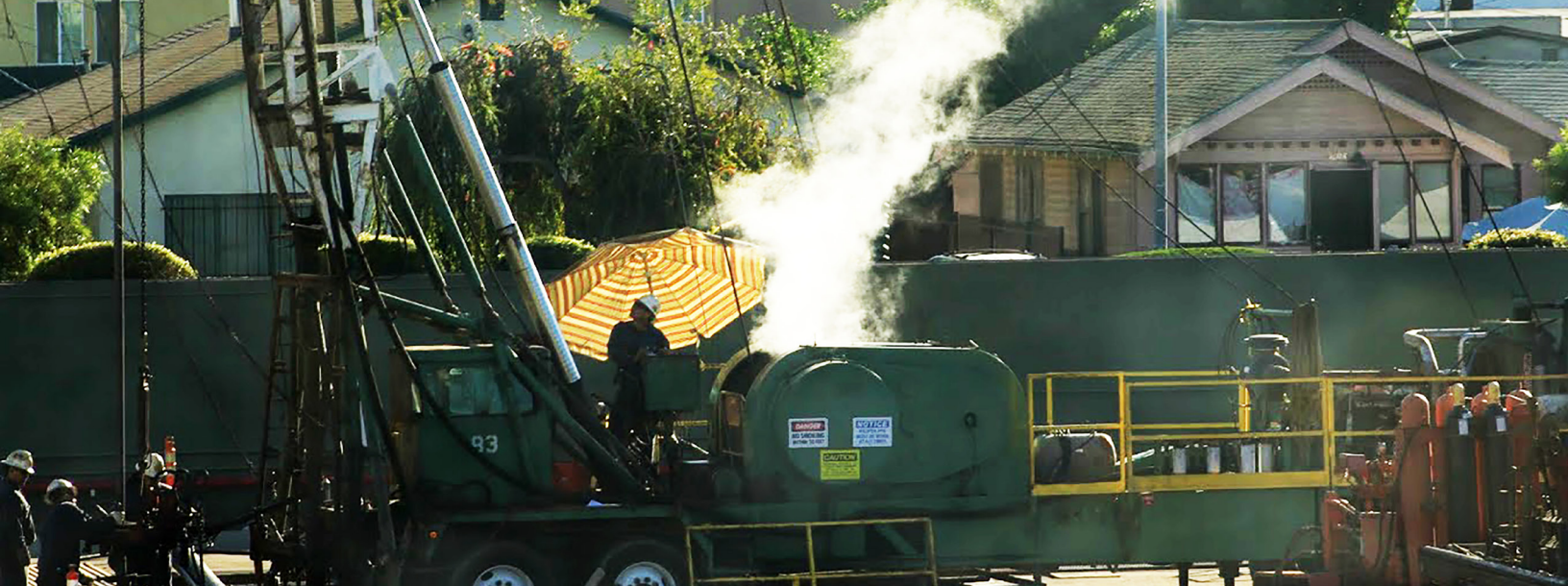
Cover photo: Signal Hill, Greater Los Angeles area, by Harrison Weinberg; Photo above: Jefferson drill site, Los Angeles, by Redeemer Community Partnership