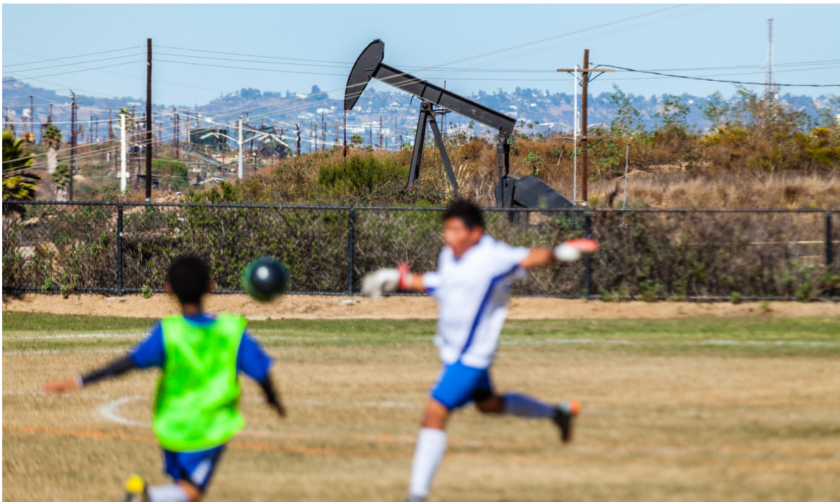
Inglewood Oil Field