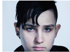
5 Shows on Netflix That You Should be Watching