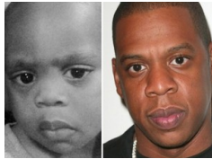
15 Non-Related Babies Who Shockingly Look Like Celebrities