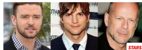
34 Celebrities Who Own Restaurants