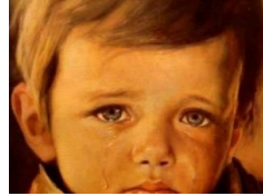
15 Famous Objects That Are Cursed