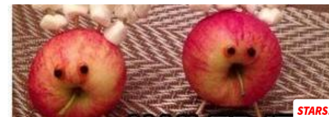
26 Tragically Hilarious Thanksgiving Pinterest Fails