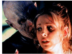
The 15 Most Controversial TV Show Episodes of All Time