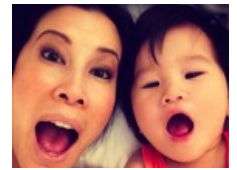
10 Celebs Who Had Babies Later in Life