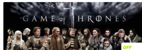
Which Game of Thrones Character Are You?