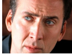
14 Stars Who Lost Everything