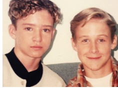
7 Celebs You Won't Believe Were Roommates