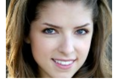
Huge Stars Who Are Actually Really Tiny Aged