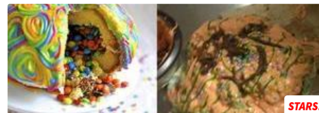
33 Hilariously Terrible Dessert Pinterest Fails

1- Why did you "allude" to the point you were trying to make in this post in your previous post. Why does it take you multiple posts to say the same thing? Spam