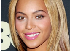
10 Female Celebs Whose Weights Might Surprise You