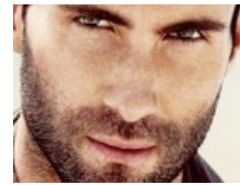
17 Stars Who Were Rich Before They Even Got Famous