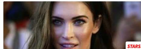
51 Celebrities You Probably Don't Know Are Bisexual