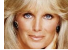
You Won't Believe How Well Linda Evans Has Aged