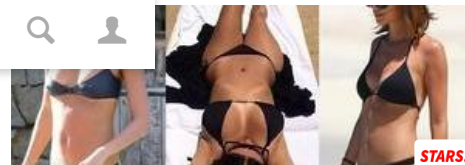
34 Celebrity Moms ROCKING It In Bikinis