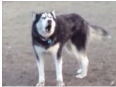
Husky Throws a Tantrum When It's Time to Leave the Dog Park