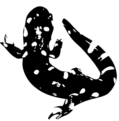
CALIFORNIA TIGER SALAMANDER