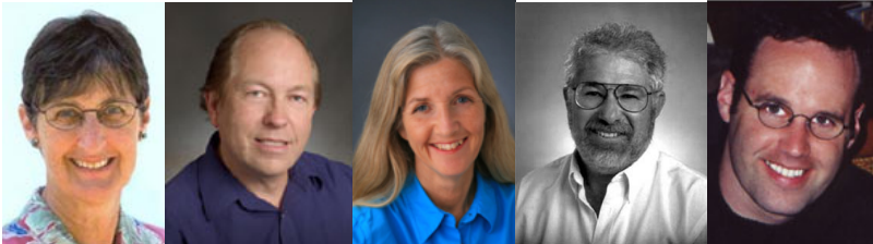
-No wonder they're all smiling-

Want to know what else your City Council has been up to?