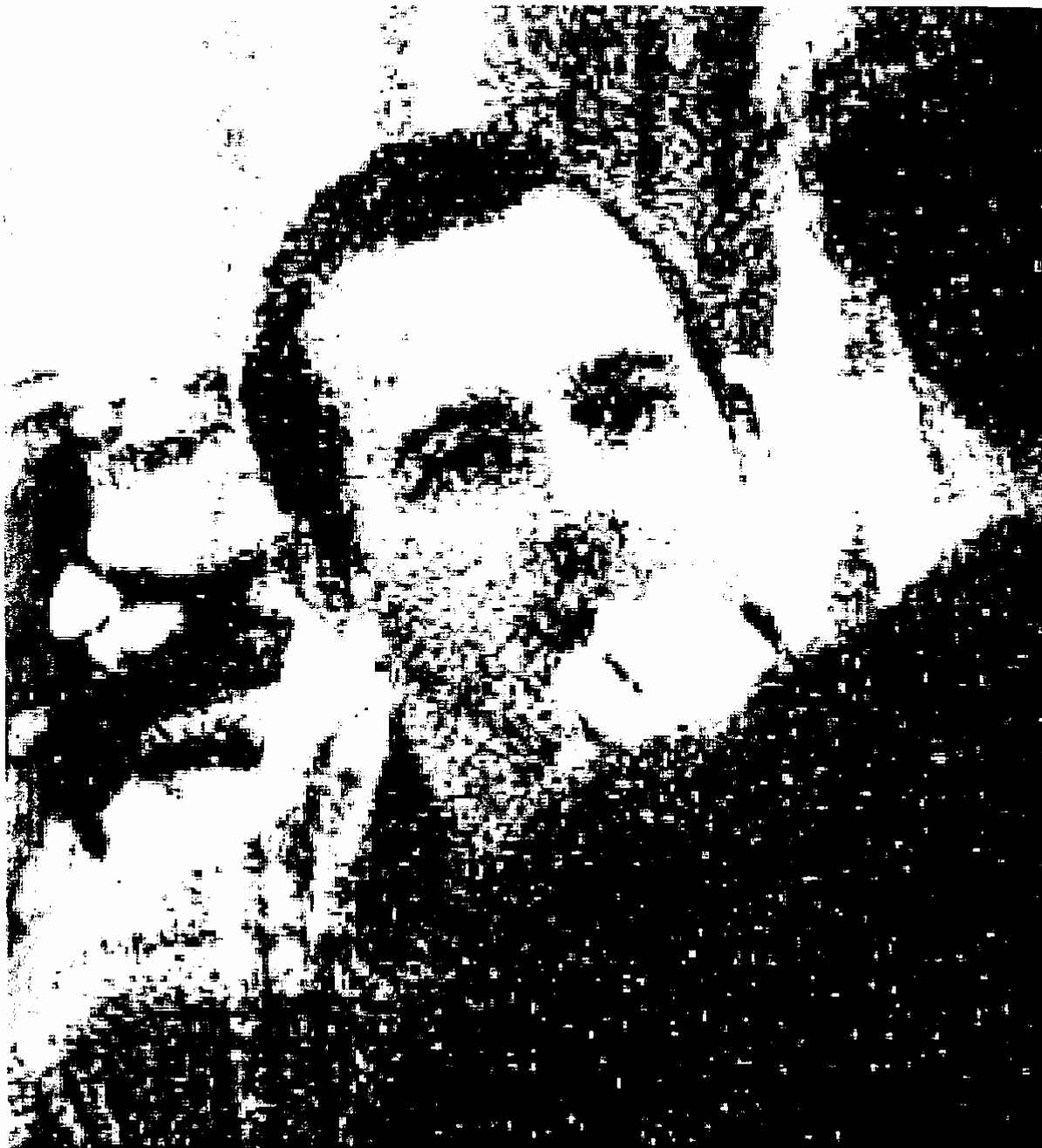
Undercover officer photographed at meeting in private home