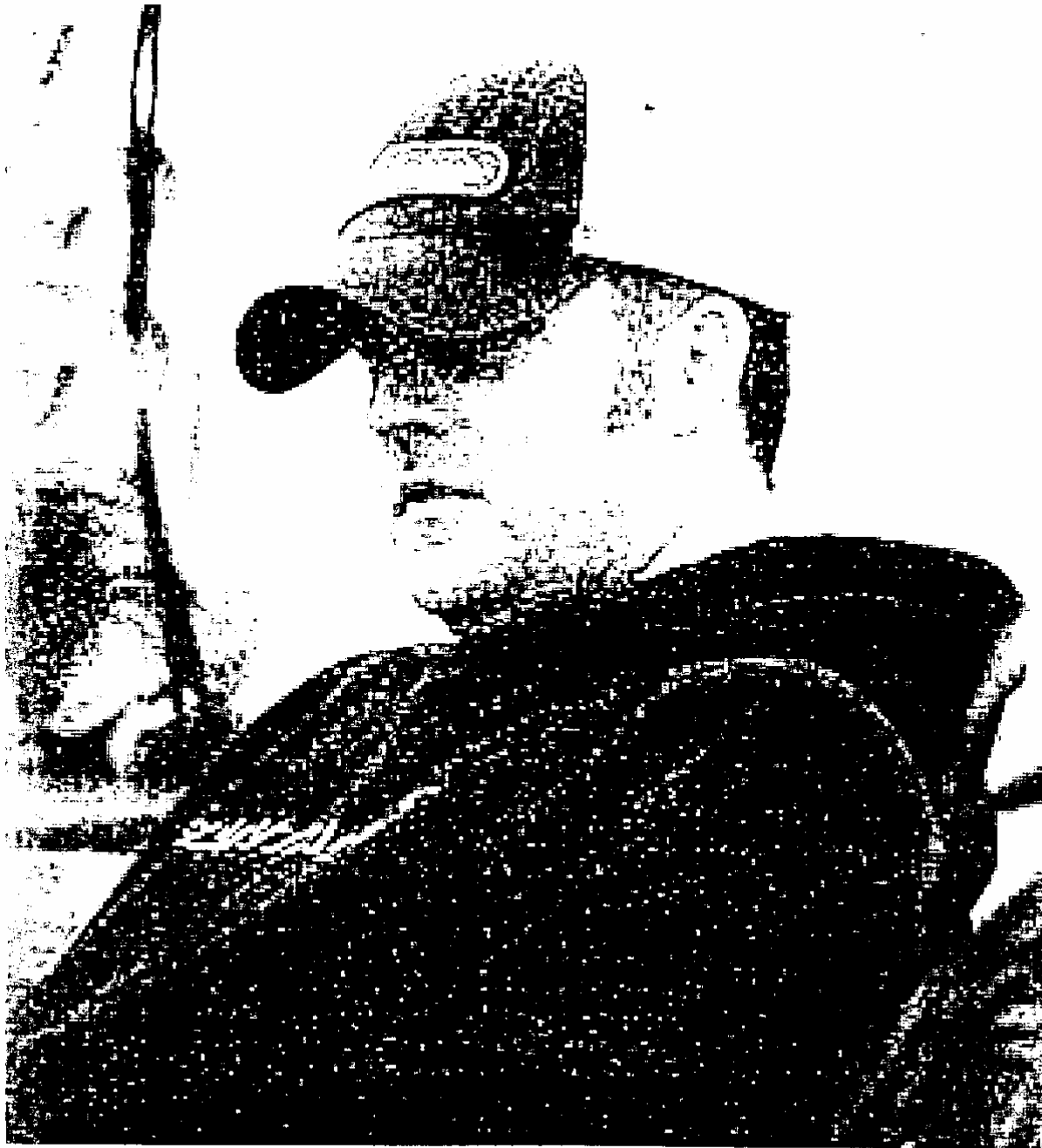
Undercover officer photographed at meeting in private home