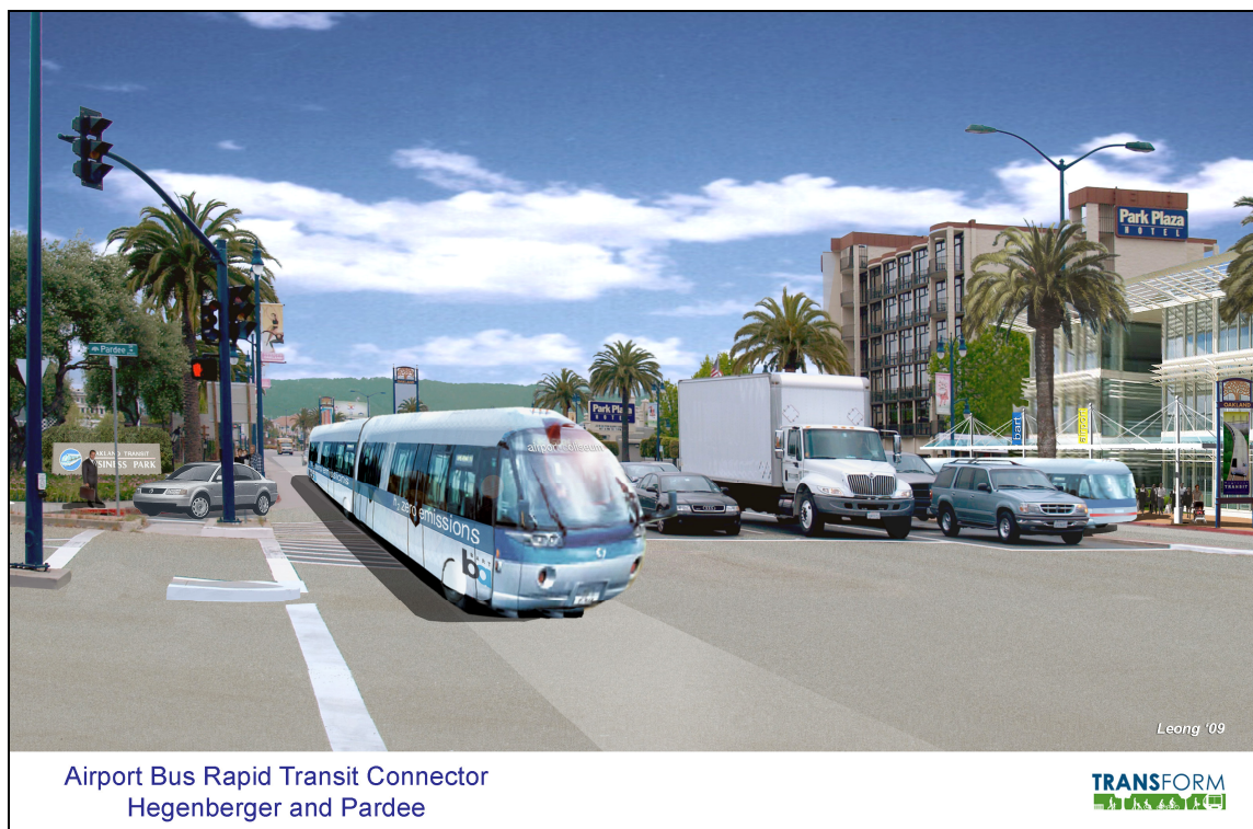
Figure 2 – Right-hand queue jump lanes would allow RapidBART to bypass traffic congestion, greatly improving speed and reliability. New stop is visible across intersection

Queue jumpers are particularly applicable along major roadways like Hegenberger, where lack of available right-of-way may preclude a continuous exclusive-busway.