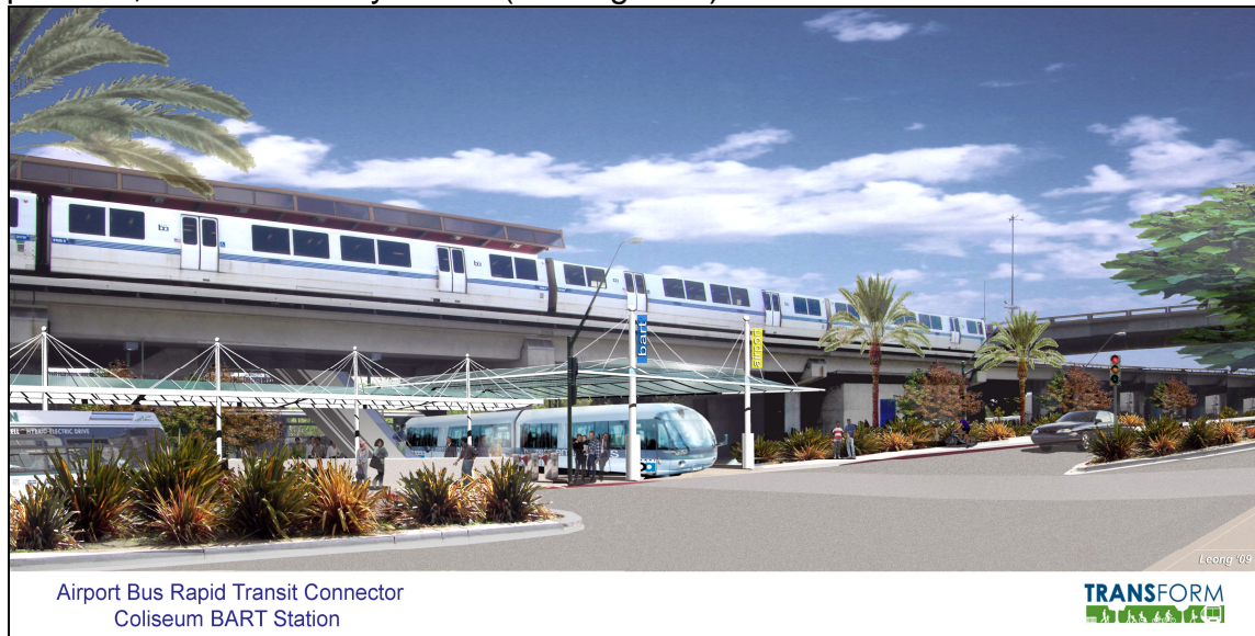
Figure 3 - The proposed Coliseum RapidBART station would be clearly marked, covered and inviting.

The Coliseum RapidBART Station would ideally be located at street level of the east end of the existing BART station, perpendicularly under the Coliseum BART Station and across San Leandro Street from the Hegenberger on-ramp. This space under the BART tracks and platform is currently vacant. There is a No Stopping zone in the curb space in this area, and the RapidBART station would be about 300 feet east of the curbside berthing area currently used by AirBART and AC Transit buses. Escalators, elevators, and stairs would link the RapidBART station directly to the east end of the BART station platform, located directly above (see Figure 3).